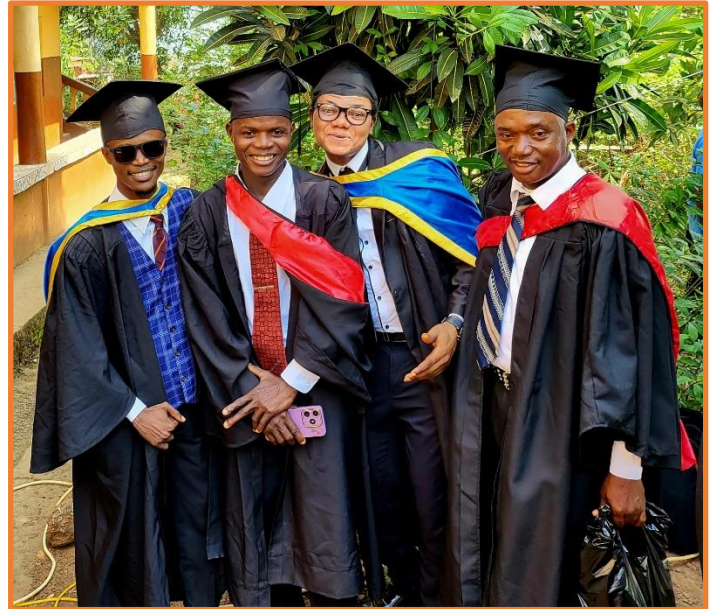
December 2023 Graduates from Sierra Leone