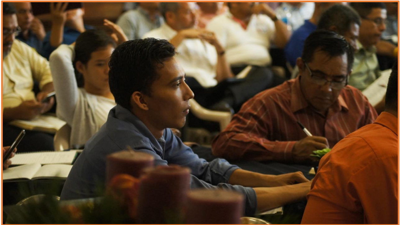
Students in San Salvador, El Salvador in Preaching Class