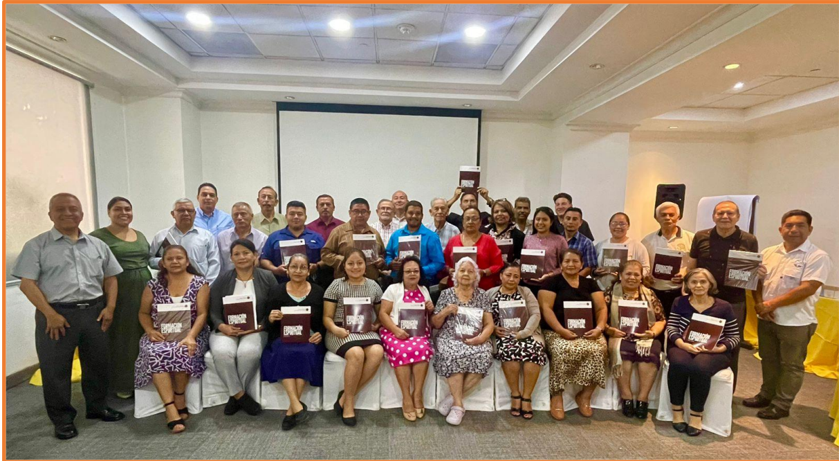
In December, the first class (Spiritual Formation) being taught in El Salvador to a new group of students in a new partnership with E3 and the Baptist Convention in El Salvador.

Open and closed doors can be frustrating, but the key is to pivot and move as the Holy Spirit leads . I am so blessed to be a part of P2P, an organization that is strategic in its planning, but also reliant upon the leadership of the Holy Spirit. As the Holy Spirit opens and closes doors, we must remain obedient when God says, “You cannot go there right now...I need you somewhere else.” I’m grateful to work together with leaders who — when we see the vision God gives us ( Acts 16:10 ) — “get ready at once” and go where the Holy Spirit leads.