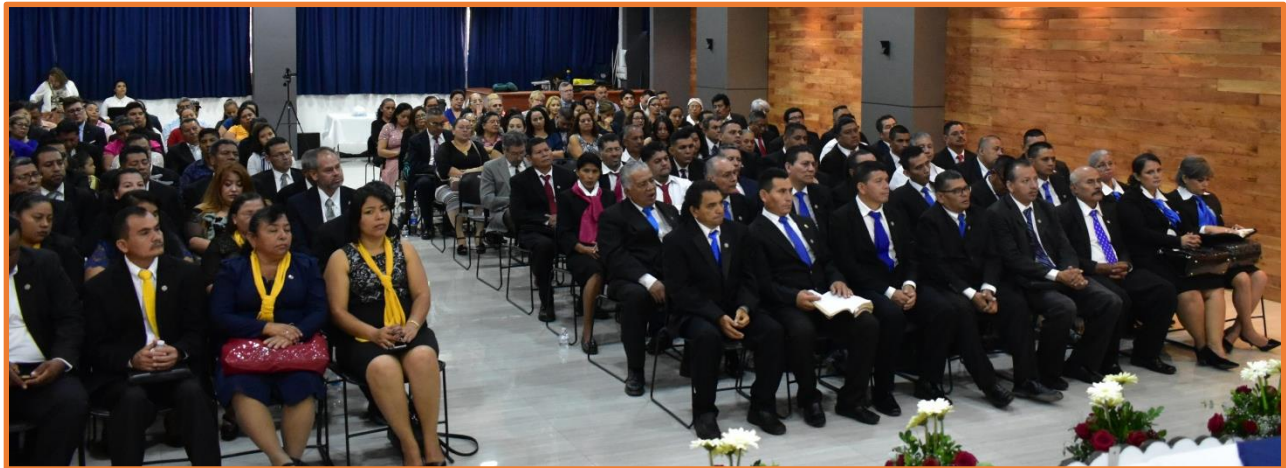
P2P Graduation in San Salvador

Thanks to your prayers and support, P2P will graduate nearly 1000 pastors and leaders in 2023 ( includes 5 large classes in Peru this January ) in 17 locations in 6 countries: Costa Rica, Peru, Sierra Leone, Honduras, the Dominican Republic, and the United States. Graduation is always an exciting time for our graduates, but it is often far more for the students, their churches, and their countries.