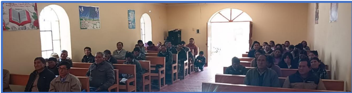
A P2P course this year in Calca, Peru, within Cusco Province.