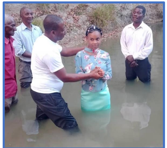
A Haitian church planter and P2P graduate baptizing new converts

(He then sent multiple pictures of baptisms and the locations where students have started new churches.)