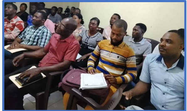
Haitian P2P students in class