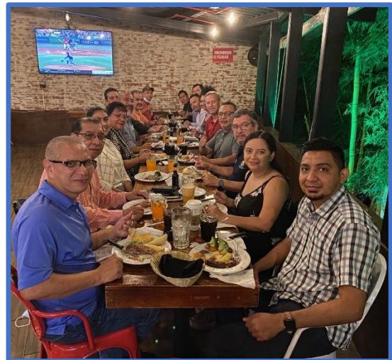
The P2P Team in El Salvador is enjoying a meal together