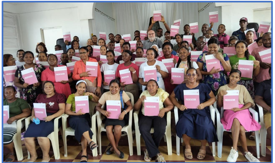
Graduation in Bolivar Colombia, November 2025

One of the comparisons that emerged in a recent evaluation of P2P is how remarkably cost-effective this model is. Many pastor training ministries require enormous financial investment—teams traveling, translators hired, materials shipped, venues rented. And while those ministries do beautiful work, the costs often limit how far they can reach.