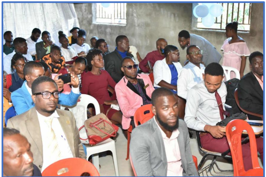
Students in Haiti, November 2025

This is multiplication, not addition. This is what makes P2P so effective globally.